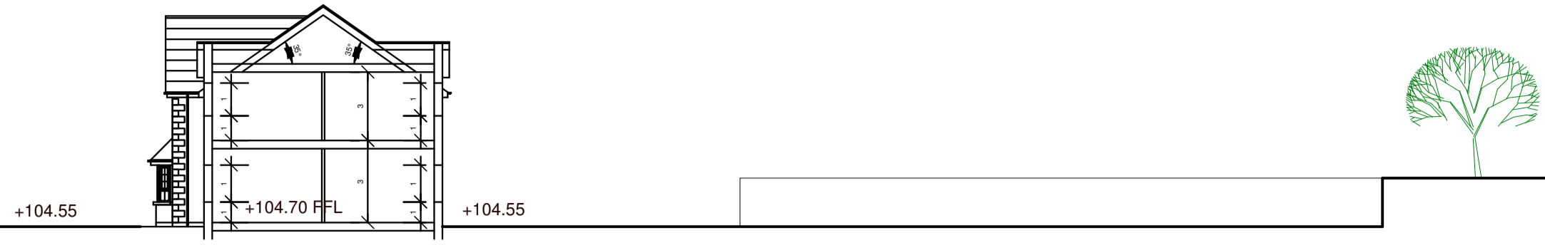
SITE SECTION SCALE 1 TO 200

+104.70 - LEVELS AS PER PLANNING PERMISSION REF 07/73 AND 08/358